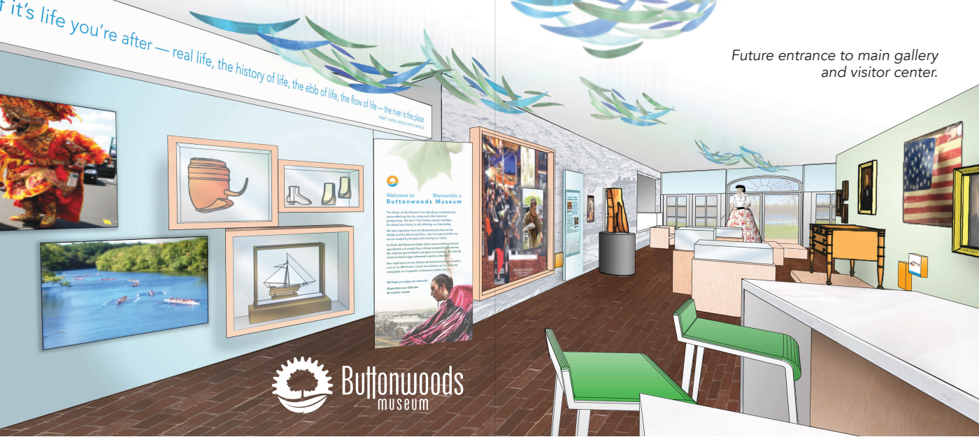
Future entrance to main gallery and visitor center.